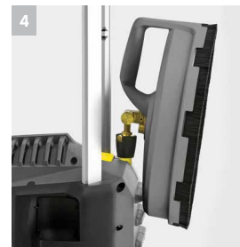
Shown with optional surface cleaner 2.111-016.0